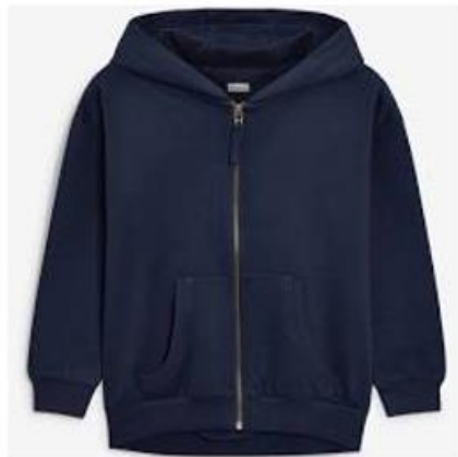
Navy or Black Jogging suit