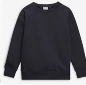
Navy blue cardigan or jumper (with or without school logo)