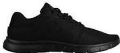
Plain black trainers