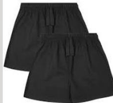
Black or navy shorts