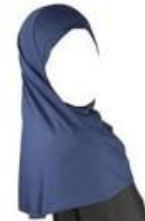
Plain navy, grey or white head scarf