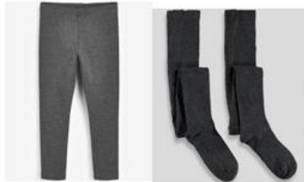
Grey leggings or tights (under skirt/dress)