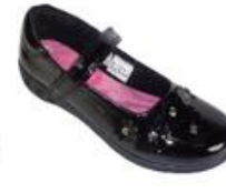
Black school shoes