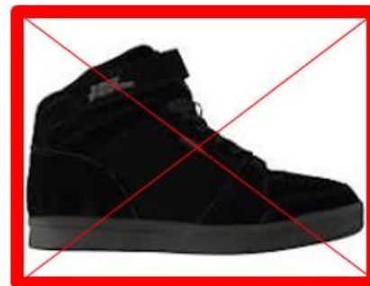
NO trainer boots

No earrings should be worn to school on a PE day.