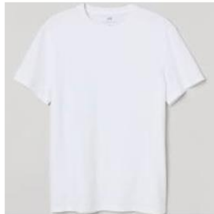
White round neck T-Shirt