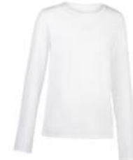
Long sleeved vest If required